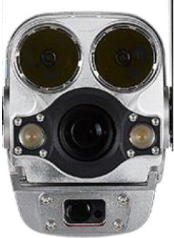
Wireless Manhole Camera