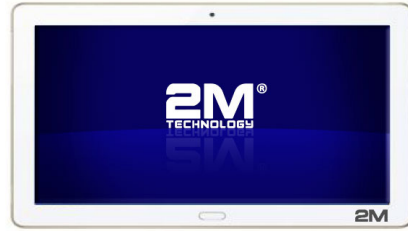
Touch Screen Tablet